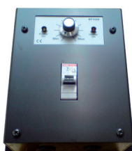
energy regulator Réf. 690001