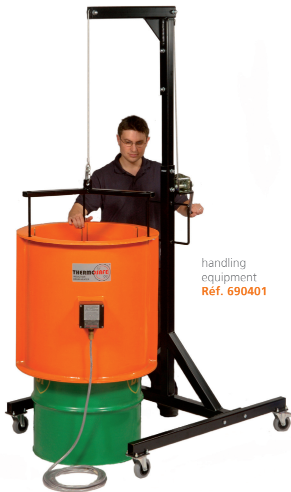
handling equipment Réf. 690401