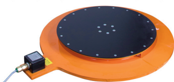
induction base heater Faratherm range Réf. 660401