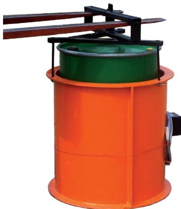
handling equipment Réf. 690403