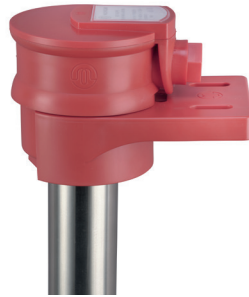
Angular Immersion Heater with HWB Support

ROTKAPPE angular immersion heaters consist of the heated horizontal immersion tube, the long-life heating cartridge, the unheated vertical immersion tube, the terminal casing and the lead.